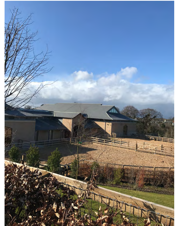
Appropriate countryside recreation includes horse riding facilities

The keeping of horses for equestrian purpose is not included in the definition of agriculture (section 277 of the Town & Country Planning (Scotland) Act 1997 (as amended)) but is, in principle, a use appropriate to rural areas. Provided it can be demonstrated that a countryside location is essential, cattery and kennel uses may also be acceptable.