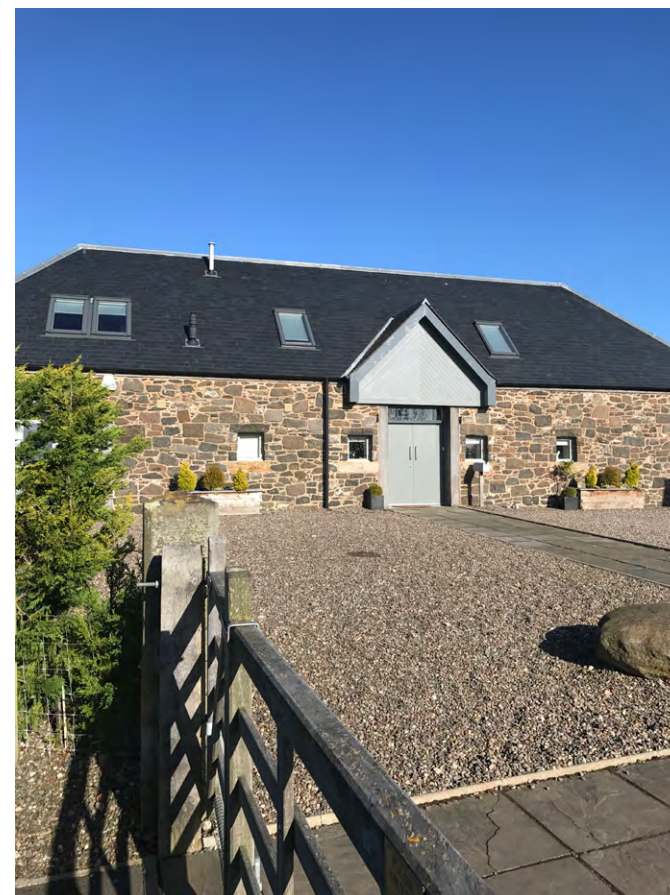
Dwellinghouses in the countryside and greenbelt can be sympathetic to an existing rural character through use of materials and design.

The design and form, choice of materials and positioning of proposals must be compatible with the rural character of the area and respect the landscape quality. Proposals should consult the Edinburgh Design Guidance.